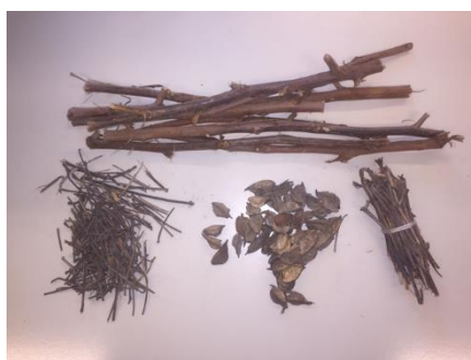
Fig. 1. Air dried cotton stalk samples.

Cotton stalk samples were obtained from Syrian agricultural production. The CS was a mixture of small pieces of the main stem, branches, burs, boll rinds, bracts, and peduncles in various shapes and sizes (see Fig. 1). It was ground and sieved to produce a granular powder with a particle size of 1–3 mm. The cotton stalk employed herein contained 44.75% C, 5.75% H, 48.57% O, 0.9% N, and 0.03% S on a dry ash free basis (DAF). Proximate analysis performed on a dry sample indicated that it contained 76.44% volatile matter and 5.08% ash, resulting in a fixed carbon amount of 18.48%. The HHV of raw CS was 18.32 MJ kg -1 . The ultimate and proximate analysis of composition and HHV of the raw CS feedstock and of each pyrolysis char was determined in accordance with ASTM standards [21].