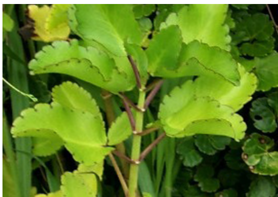
Fig. 1. Bryophyllum pinnatum plant.

The plant Bryophyllum pinnatum (Crassulaceae) depicted in Fig. 1 is commonly known as air plant, miracle leaf, life plant etc. It is accepted as a herbal remedy in some parts of the world, Nigeria inclusive. Many of its uses have been validated by animal studies and clinical investigations (Rossi-Bergmann, 2000; Igwe and Akunyili, 2005). This research investigated the efficiency of this plant as a metal hyperaccumulator for phytoremediation of heavy metal contaminated soil.