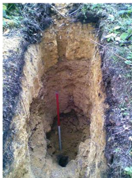
Fig.1 Soil profile in the Lgota region

and also chemical forms of their occurrence (BCR method) were determined.