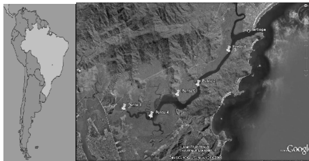
Fig. 1. Sampling cores along Bertioga Channel (Southeastern Brazilian Coast).

Elemental preparation and analysis (As, Cd, Cr, Cu, Ni, Pb, Sc and Zn) followed SW-846 methodologies (USEPA, 1996, 2007), applying ICP-OES technique (Varian MPX 710ES model). Geochronology was determined via gamma spectrometry, by 210 Pb xs and 137 Cs methods, using a low background Ge detector, EG&G Ortec, model GMX 25190P, as described by Figueira et al. (2007).