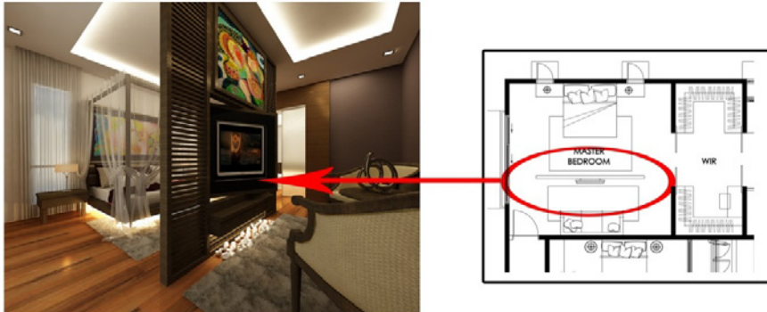
Figure 5: Wood can be a fixed wall and a divider, also as a cabinet for television.

By example from figure above, gypsum can be a divider between living area and bedroom because gypsum board are easy to install for several reasons and using dry construction. Preventing the transfer of unwanted sound to adjoining areas is a key consideration when designing a building, specifically when taking into account the intended activities of the occupants in the various parts of the building (Gypsum Association). Gypsum wall board is the most common interior finish used in Canada and the United States. There are several types of gypsum board manufactured for specific purposes.