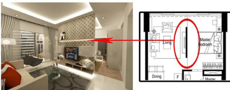
Figure 4: The fixed wall made by gypsum as a divider between living area and bedroom

Gypsum, wood, plywood, Styrofoam, structural insulated panel (SIP), bamboo, composite material and glass is a material for making fixed wall. Using this material, the wall can be made and safely can be removed without using a big construction renovation because they have their own strength. Malmgren, et. al [14] has divide the product in four different views the complexity of the product can be reduced and each view represent the interest of customer, engineering, production and assembly respectively. Wilson [15] present invention relates to a removable wall panel, and particularly to a decorative panel which may be easily and conveniently installed.