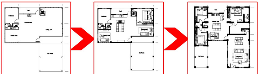
Figure 1: Evolution of house renovation using flexible floor plan with sustainable inner wall.

The concept of flexible floor plan it very suitable and conveniences for sustainable green inner wall. Because the concept flexible floor plan has provided basic needed such as bedroom, living room, kitchen and also toilet. One of the strategies of flexible floor plan concept is to offer the landed property focusing on terrace house with lower house price for middle income group buyer because the construction cost will be reduce by reducing the inner wall [6].