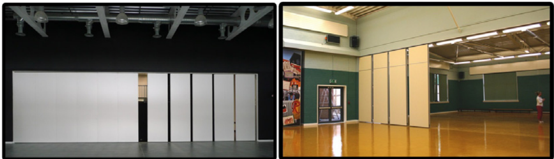
Figure 6: Moveable wall are easy for instalment and just do it by the owner itself

Movable wall is making it possible to divide one room into several different ones and can separate one room into various small rooms. With movable walls it can divide a large room into a smaller one and turn it back into a large room again anytime they want. Movable wall can be a rolling, mobile, sliding or folding room divider which provide temporary walls in place of traditional non mobile products such as operable walls, accordion partitions, cubicles, pipe and drape, and shoji screens. They are sometimes folded and are on wheels enabling mobility and ease of storage. Moveable walls have manufactured in a highly modern facility using innovative hi-tech materials to achieve a very high quality product. The lightweight design makes even large moving wall panels easy to move and reduces structural support requirements [16]. Folding wall which can either be hung