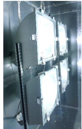
Fig. 1. a) view of the thermal chamber; b) view of the solar simulator.