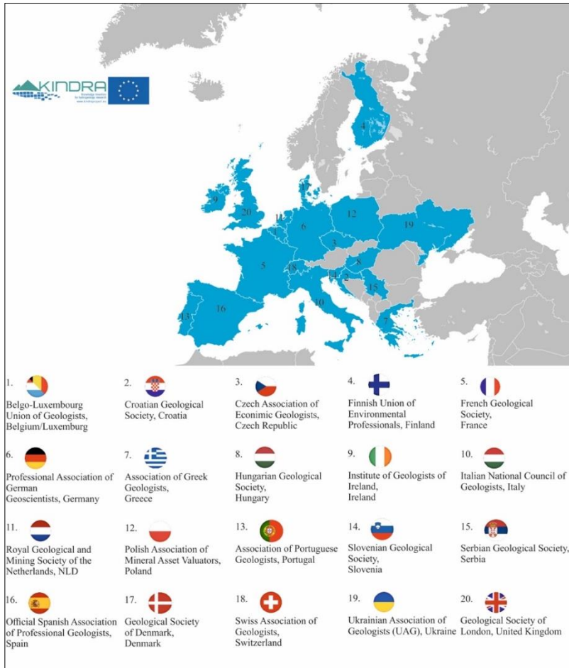
Fig. 1. Partners in the KINDRA project (based on [2]).