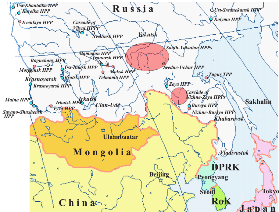
Fig 2. Map of hydropower resources development in Eastern Russia and directions of ISETs with NEA countries.

As can be seen from Table 1, Japan has practically utilized its hydropower resources, including the construction of pumped storage power plants. Their rapid development until 2011 was necessitated by the need to level the electricity production of intensively constructed nuclear power plants. After the accident at the Fukushima-1 nuclear power plant and decommissioning of practically all nuclear power plants in the country, the available capacities of PSPPs provided opportunities for the large-scale construction of