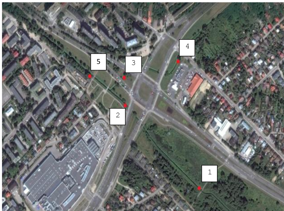
Fig 1. Location of measurement and control points.

Within the framework as part of the research carried out at the Department of Technology in Engineering and Environmental Protection, an analysis of the composition of rainwater pollutants from a selected catchment in the agglomeration of the city of Białystok was carried out. A catchment located in the south-eastern part of the city, characterized by diversified buildings (high- and medium-sized housing estates, low-detached, single-family neighborhoods, service and recreation areas) and the presence of the main communication glazing was selected for the research. Five measurement and control points have been selected as shown in the figure below.