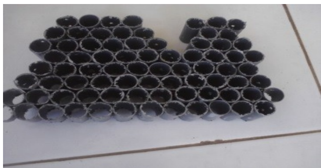
Fig. 1. Biofilter Media in a shape of Honey Comb Tube

media in the form of honey comb tube was shown on Figure 1.