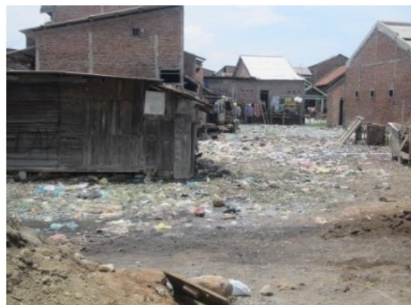
Fig. 3. Environmental Condition of Tanjungmas Fishermen

So most of the fish and other catch in TPI is the catch from fishermen with bigger boats owned by fishermen outside of Tambak Lorok. This is because most fishermen in Tambak Lorok use a relatively small boat with a smaller assets of course, so that the effect on the range or distance of the ocean that can be sailed and ultimately affect the quality and size of the catch. The people that works as fishermen, laborers, and fish traders have an average income of Rp.500.000 - Rp.1.500.000 / month. Every day the fishermen get a gross income from the sale of the catch of Rp. 500.000 then it was cut to buy diesel fuel for the ship amounting Rp.300.000.