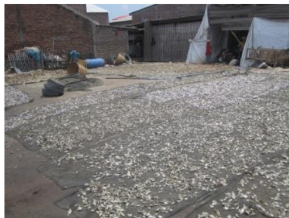
Fig. 2. Fishermen's catch

of families are at sea assisted by their teenage and adult boys. Most fishermen here use private boats with a group system or use a rented vessel with a payment model through revenue share for the catch obtained. Most of the fishermen's catch is sold directly to the broker who will sell the products outside of Tambak Lorok area especially to Semarang City and its surroundings as well as to the restaurants that wanted certain quality and type. A small portion of the catch is sold directly to the market in Tambak Lorok, at the restaurant.