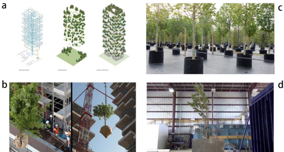
Fig. 3. Vertical Forest in Milan - first prototype of the new sustainable building typology: a – Irrigation system of the building and planting scheme; b – Planting of the trees on balconies; c - Trees in the nursery before being planted; d – Wind-resistance test of the tree species in Florida, USA.

The real revolutionary element of the project – its trees– has influenced every part of the design. The vegetation is the outermost exterior element of the envelope and represents a filter between the interiors of the towers and the urban environment.