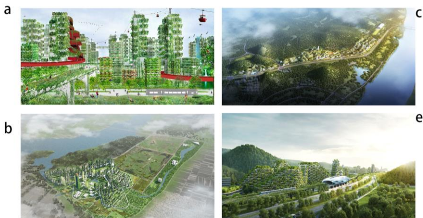
Fig.5. Forest cities of Stefano Boeri Architetti: a – Shijazhuang Forest City conceptual vision, China; b - Shijazhuang Forest City bird view; c – Liuzhou Forest City; d – Liuzhou green buildings and transport of the future

In 2014, the first two towers completely covered by trees and shrubs, equivalent to 20.000 sq m of real forest, have been completed in Milan. Since then this idea of densification of greenery in urban environment received scientific and political approval of its efficiency. Just two towers are able to absorb 19 tons of CO 2 a year and to produce the comparable amount of oxygen. The presence of trees improves considerably the quality of living environment, both for the residents and other citizens, by humidifying the air, filtering the sun rays in summer, reducing the temperature inside the apartments by 2-3 grades. But how can this concept help to fight the air pollution on urban scale?