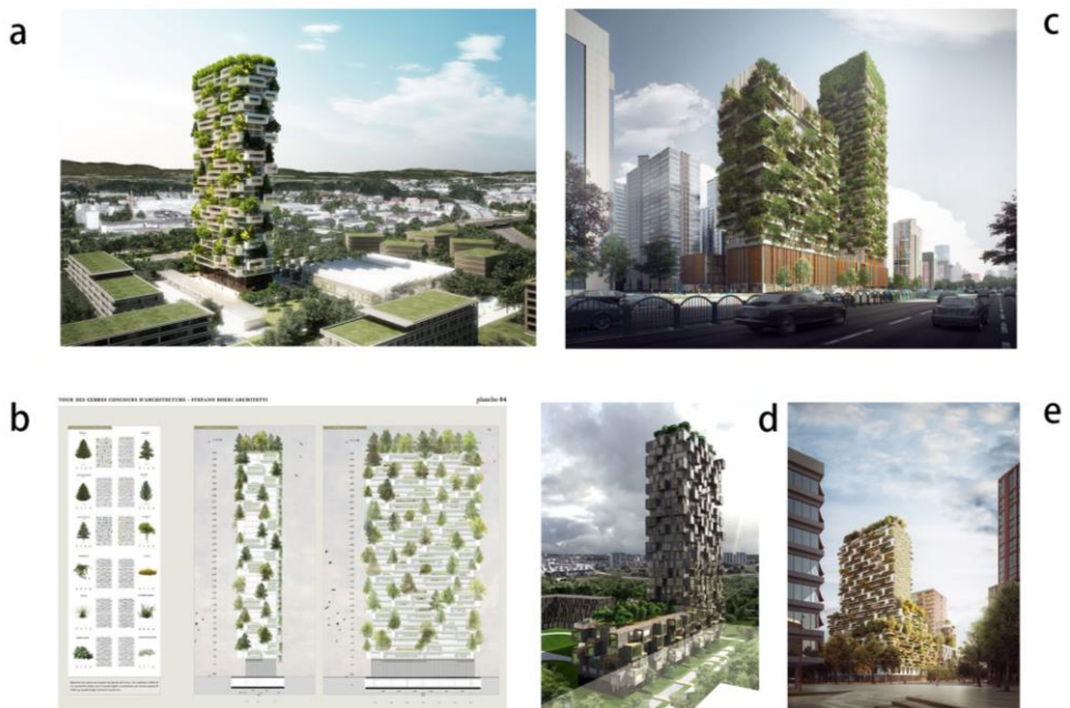
Fig. 4. Other high-rise buildings by Stefano Boeri Architetti in the world: a – Tower of cedars, Lausanne, Switzerland; b – Tower of cedars planting scheme and tree species used; c – Nanjing Towers, China; d – Urban tower, Antwerp, Belgium; e – Wonderwood, Utrecht, Netherlands.

“ Les Terraces des Cedres ” is not just a tower, nor simply a tall residential building. It is the prototype of a new dwelling model, a building that combines the comfort of the apartments, the wonderful view of the lake and nearby areas, with the vegetal world; especially with the various species of cedars that already inhabit the territory. A landmark that can be spotted from Lausanne northern border.