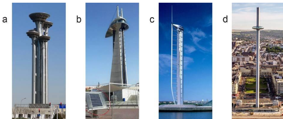
Fig. 2. Examples of observation towers located in the urban environment: a - Beijing, China [29]; b - Madrid, Spain [30]; c - Glasgow, Scotland [31]; d - Brighton, England [32]

Modern observation towers ceased to be the ordinary engineering structures long time ago. Unique technical and architectural solutions allow them to become city or area symbols, identifiers. This is most evidently seen in the tower construction in the urban environment (figure 2).