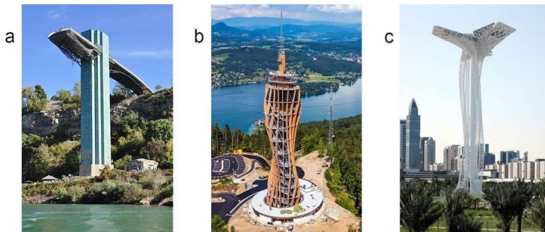
Fig. 4. Examples of the accentual approach to integration of observation towers in the natural / natural-anthropogenic environment : a - USA [36]; b - Austria [37]; c - United Arab Emirates [38]