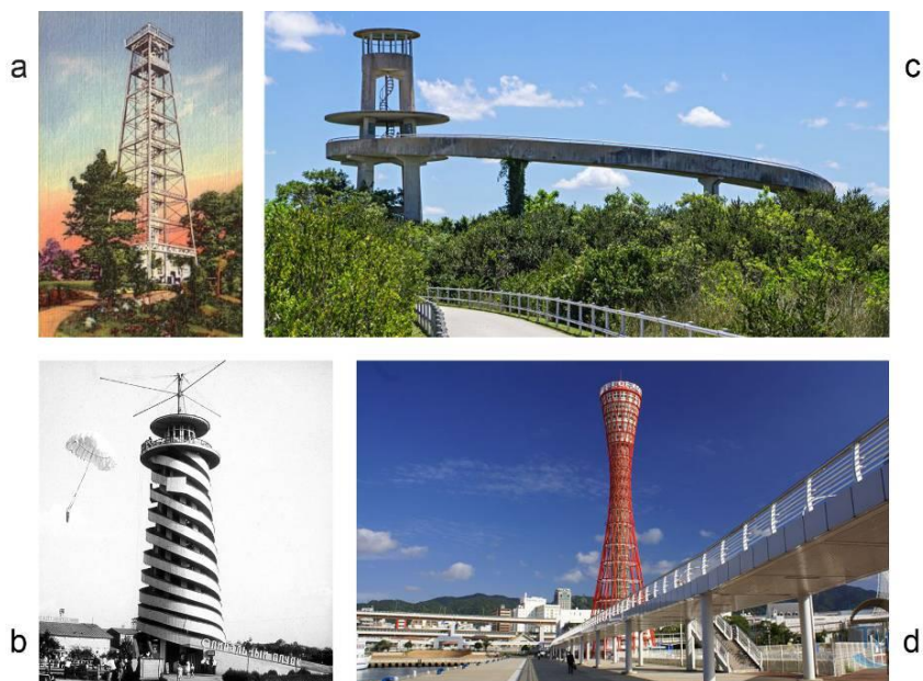
Fig. 1. Examples of tower structures of the 20th century:

a - national park Hot Springs, USA, the photo was taken in 1932 [21], b - Central Park of Culture and Leisure named after Gorky, Moscow, USSR, the photo was taken in 1937 [22]; c - Shark Valley, Miami, United States [23]; d - Kobe, Japan [24]