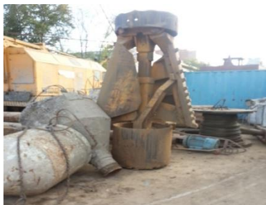
Fig. 3. The widening tool.

The base widening of the piles was carried out by mechanical means. Fig. 3 shows the used widening tool.