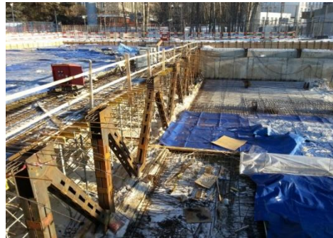
Fig. 5. Construction of 3-storey underground parking. Slab supported by truss structures.