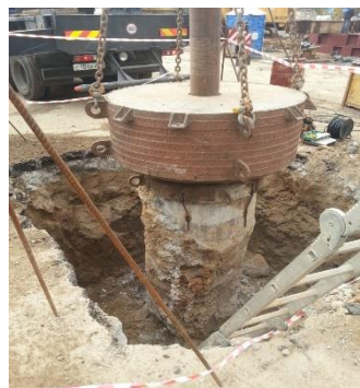
Fig. 7. Pile No. 237 after ELDY test.

The image of the pile after testing by ELDY method (Fig.7) indicates that the pile is not damaged.