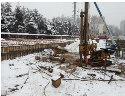
Fig. 2. The retaining structure for the excavation and pile drilling.

Foundations under high-rise part of the building consist of bored piles joined by slab 2.0 m of thickness. From the bottom of the excavation, having a depth of 7.45 m, length of the piles is 23.5 m with a base widening of 1.5m and a height of 1.5 m. The relative level of the low pile end is -29, 450 m. Bored piles have a diameter of 800 mm, the spacing is 3.5 and 2.5 m. Under the end of piles there are the cretaceous fine sands. Piles are drilled in this stratum to not less than 1 m. Absolute level of the pile end is 166.85 m. The piles are drilled from a ground surface, although they are casted up to the bottom of the pit. Above the pit shafts are filled to the surface with gravel.