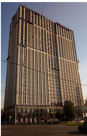
Fig. 1. Construction of the high-rise building at Leninsky Avenue street in Moscow with attached underground parking.

Residential 33-storey building with built-in 1-storey underground level (Fig.1) has an attached underground 3-storey car parking with single storey aboveground pavilion, which is the entry to the underground parking. One-storey underground level under the high-rise part of the building connected by an underground passage in the first underground floor at level -5,200 with a 3-storey underground parking. Dimensions of high-rise part are 71.5x29.6 m, attached underground part – 103.3x35.0 m. The retaining structure of a one-storey underground level excavation was designed from metal pipes 426x10 mm 13 m long with metal wale beam and wooden lagging, with corner struts and raker struts of pipes with a diameter 530x10 and 630x10 mm, respectively (Fig.2). Prime excavation was pre-arranged with depth of 4.0 m. The load bearing structures of the building are reinforced concrete walls and columns.