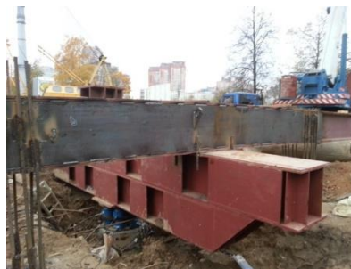
Fig. 6. Pile No. 66 static test.

The bearing capacity of the bored piles was determined on-site by ELGADTOP company. Two methods were used: static load (two piles) according to [19] and dynamic load by the ELDY method (two piles) according to the test programme, developed by ELGADTOP [20] and proved by NIISF RAASN. While testing pile No. 66 (Fig.6) with static load the supplement piles No. 36,38,96,98 were used as an anchors. The load was applied in five steps. The settlement of pile reached 18.9 mm. Bearing capacity of the pile estimated F_d = 885 ts.