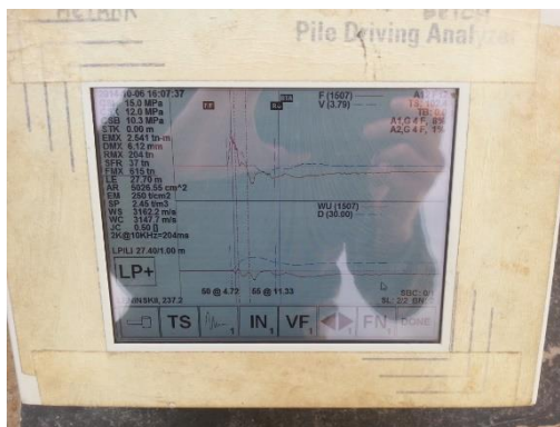
Fig. 8. Computer monitor recording the ELDY test process of pile No. 237.

Fig.8 depicts a computer monitor that records the process and parameters of the test.