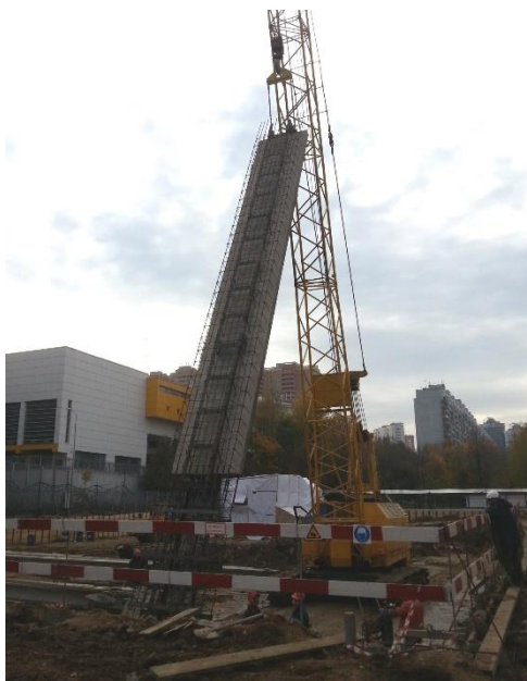
Fig. 4. Precasted panel for diaphragm wall of 3-storey parking.

The depth of the pit was 12.20 m (absolute level of the bottom was 182.595 m). Diaphragm wall, thickness of 600 mm – precast-monolithic, load bearing, buried into confining bed, buried depth below the bottom of the pit is 5.0 m (abs. level 177.60 m). Permeability without block wall secured through the use of prefabricated elements of high water-resistance (W12) concrete, which are arranged on the internal side and provide no filtering of water through the section of the diaphragm wall (Fig. 4).