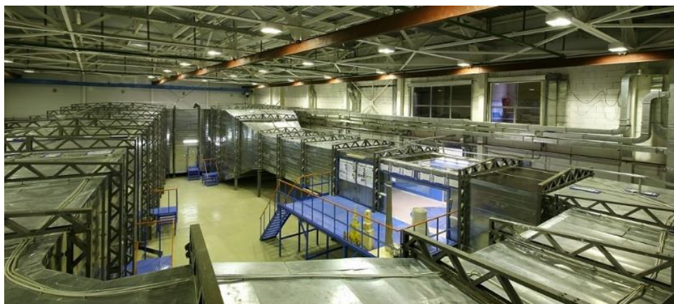
Fig. 2. Large Gradient Wind Tunnel NRU MGSU