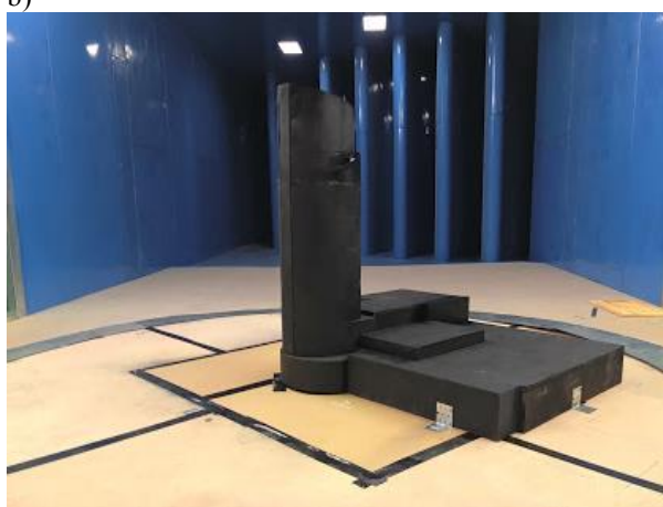
Fig. 3. a) Multifunctional business center, b) Model of a multifunctional business center

Design and production of the model on a reduced scale for experimental studies is performed. The scale of the layout is chosen from the compliance conditions established for the given tunnel of restrictions on the degree of cluttering of the cross section of the working part (in this case, M 1: 100) (Figure 3, b)) (GOST R 56728-2015) Buildings and