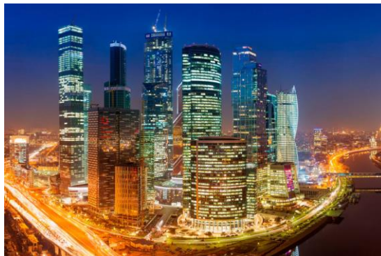
Fig. 1. High-rise buildings in Moscow (Moscow-city)

aerodynamic parameters should be included in the design documentation, including the average and pulsation components of the estimated wind load, maximum values of wind load, resonance vortex excitation, etc. However, the determination of these values is possible only based on testing the layout in high-rise objects in wind tunnels of architectural and construction type [3,4,10].