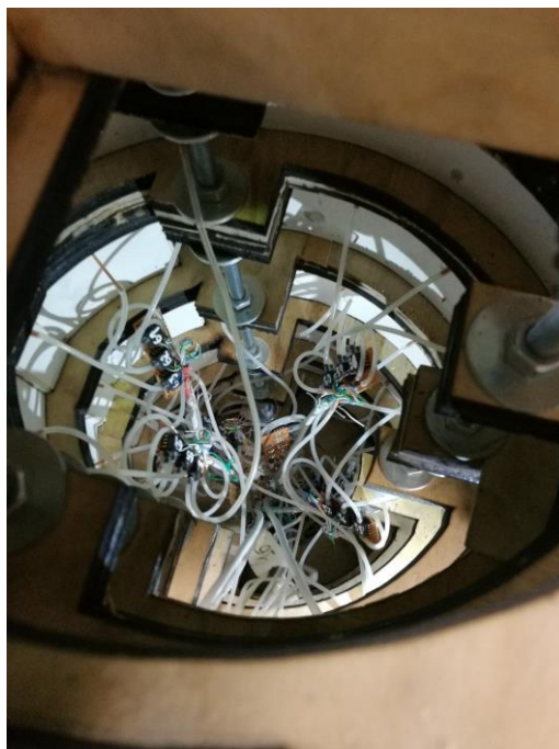
Fig. 4. Drainage system installation

The model of the investigated building was installed on a specialized turntable in the working area of the wind tunnel. After that, the installation was started and the air flow was fed to the model. The characteristic velocity of the air flow in the pipe is chosen to be sufficient to ensure self-similarity in the Reynolds number, when a further increase in speed does not lead to a significant change in the averaged values of the aerodynamic coefficients at the control points on the model (GOST R 56728-2015). During this series of tests, the wind speed in the working area was 15 m / s.