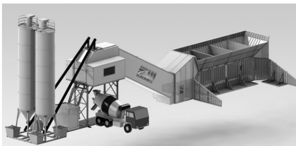
Fig. 1. Portable concrete batching plant

Technology organizational model is a primary core for establishing the costs of the construction and for its security assessment. This understanding makes it possible to evaluate consolidated design, technological and organizational solutions tailored to high-rise building. In technology organizational schemes it is important to define the most effective construction methods and the sequence of high-rises building choosing appropriate machinery, mechanisms, equipment and devices for the accomplishment of the main types of work [3]. Placing concrete batching plant (portable factory) at a construction site is an example of the effective organizational and technological solution for high-rises building [4]. It's possible to smoothly provide the facility to be constructed with ready-mixed concrete as the transportation of concrete mixture to the place of its preparation does not depend, for example, on heavy traffic.