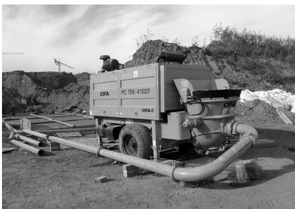
Fig. 3. Stationary concrete pump

It is possible to organize transportation of concrete in borders of building site from the mixing plant to the area that needs to be concreted with stationary concrete pumps. That plan of concreting can be relevant in high-rise buildings' monolithic foundation and carcassing.