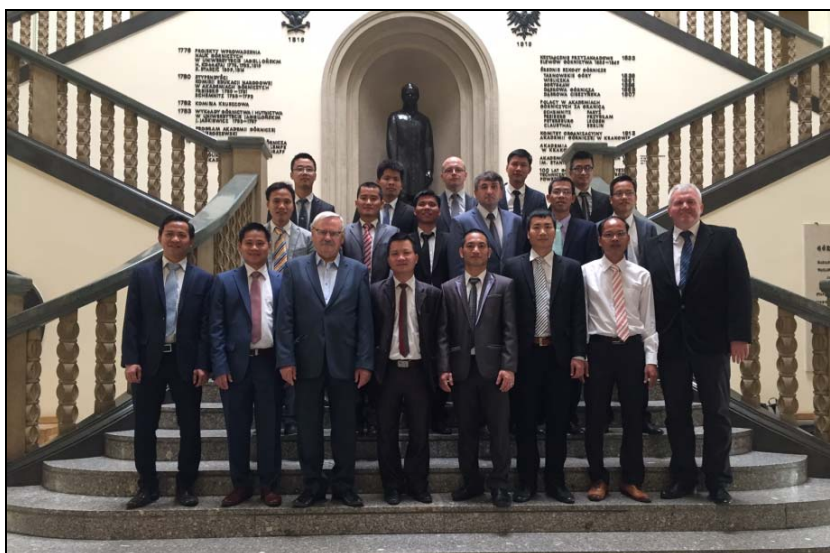
Fig. 3. Traditional picture taken after the master theses defence

In July 2017, Vietnamese students defended a master's diploma dissertation. Figure 3 presents students just after their defence of master theses, taken in the traditional place – on the stairs of the building A-0.