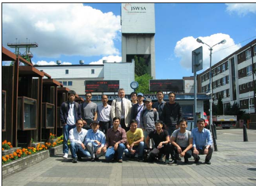
Fig. 2. Before entering the Borynia-Zofiówka – Jastrzębie, Part Borynia Coal Mine

From that moment on, the four-semester education process started. The curriculum comprised three core curriculum subjects, such as statistics, modern physics, and Polish, 25 vocational subjects and two non-vocational (humanistic) ones. The total number of hours was 1440, including 660 hours of lectures, 450 hours of tutorials, 135 hours of laboratory work and 195 hours of project work. In consideration of the educational standards, a student's workload was calculated at 30 ECTS points per semester. This number corresponds to 750 hours in a semester, half of which were classes and the other half was a student's own work. Also, four weeks of vocational training in a hard coal mine were included in the schedule.