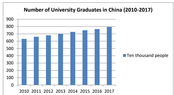
Fig. 1 Number of university graduates in China (2010-2017)

the quality of higher education and maintaining the sustained and healthy development of higher education.