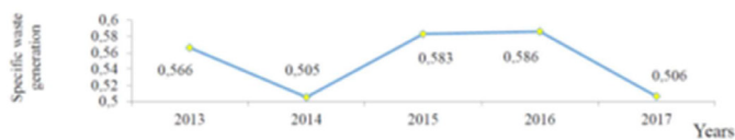
Fig. 2. The dynamics of specific waste generation of the enterprise JSC "SUEK-Kuzbass" C.M. Kirov mine, kt.

The considerable increase in economic damage from the production and consumer waste disposal considered above requires detailed analysis of this type of negative impact. For this purpose, Fig. 2 shows the dynamics of specific waste generation.