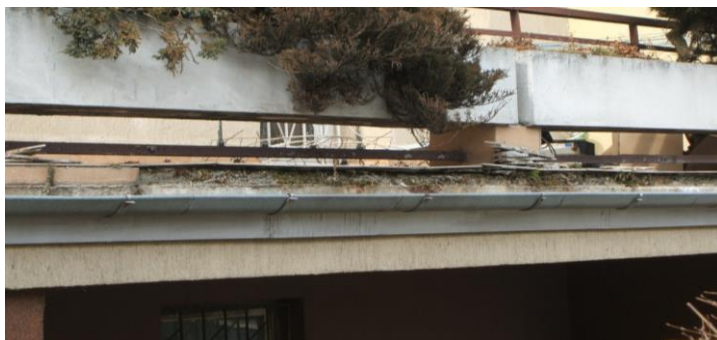
Fig 1. Example of view of the technical condition the front a terrace before modernization.

The adverse technical condition of the structure qualifies it for repairs due to number of damages caused during construction or exploitation of the building. After the site investigation and actual condition assessment, the next step will be repairing the damages. Figure 2 presents structural scheme of the terrace.