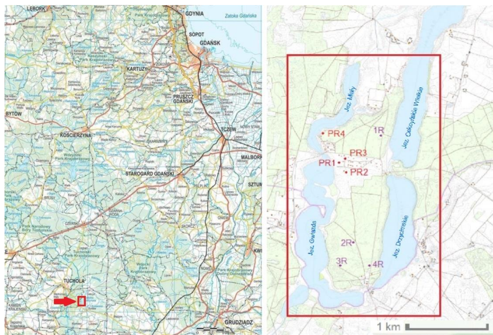
Fig. 1. Map of experimental field (PR – measurement profiles, R – investigation drillings).