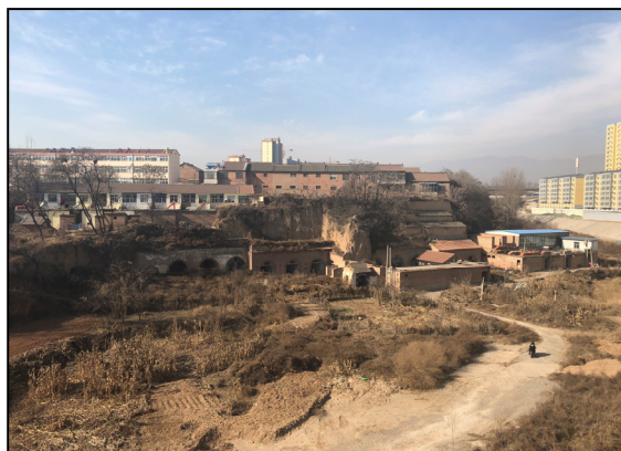
Figure 1 Present picture