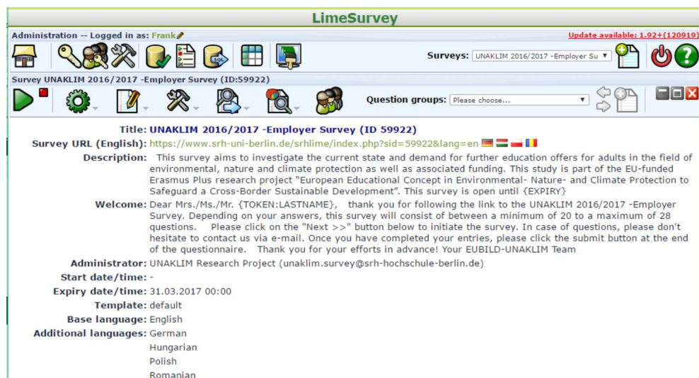
Fig. 1. SRH LimeSurvey Platform.

An online questionnaire was sent out in five languages: German, Hungarian, Polish, Romanian and in English. It was kept open from November 2016 until March 2017. A total of 1,866 targets were addressed, 400 in each consortium country was the goal. The total 112 questions were asked, there of 20 open questions, 23 closed questions (only “yes” and “no” as answer possible) and 69 questions that could be assessed by “1- totally unimportant” until “6 - very important”.