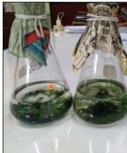
Fig. 1. Macroscopic sightings starter cultures Mastigocladus HS-46 in the Erlenmeyer flask is colored sea green.

Macroscopic observations of Mastigocladus HS-46 cultures by comparing the culture color on the Faber Castle standard color [7]. Based on the color chart, the color of the starter culture Mastigocladus HS-46 is sea green (Fig.1). The color apperance of Mastigocladus HS-46 in medium NPK 80 ppm dan 240 ppm was changed from sea green into apple green at day 14 ( t_{14} ). while Mastigocladus HS-46 in BBM and NPK+BBM not changed and still colored sea green at day 14 (Fig.2)