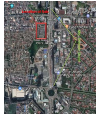
Fig. 1. Location of flats Kebon Kacang XI

The flats of Kebon Kacang were completed in 1983 and were inhabited in 1984, in an area of 1.2 hectares comprising seven vertical four-story building blocks and 18 to 36 m 2 in size at a price of between IDR 13,000,000 and IDR 16,500,000. The price was a commercial selling price for cross-subsidizing the evicted indigenous people of Kebon Kacang who get the price of IDR 5,000,000, - and IDR 8,000,000 at that time.