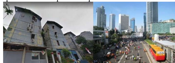
Fig. 2. Physical look of flats Kebon Kacang XI and high rise building on MH. Thamrin Street

As time went by, Kebon Kacang Housing which is located in the area of MH. Thamrin Street, Central Jakarta, began to experience quality degradation. The vertical housing that was originally built to rejuvenate the slum, became rundown and disturbing the scene. Office buildings, embassies, hotels and shopping centers along Thamrin's main road create far discrepancies and differences between the slum houses and the towering buildings surrounding it. Additionally, the value of land in Thamrin has been experiencing a considerable price spike due to its rapid development.