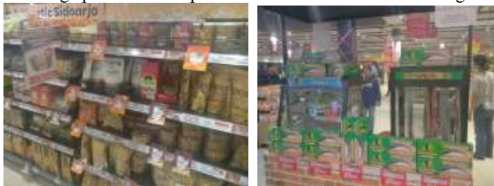
Fig. 2. SME products in X supermarket.

The type of superior product of the Sidoarjo Town which is marketed at X Supermarket is a food and beverage product. SME products marketed can be seen in Figure 2.