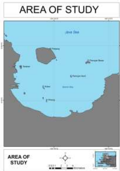
Fig. 1. Banten Bay area.

The group of the small island can be found in the north of the Banten Bay area. The small inhabited island is called Panjang Island. The small uninhabited islands namely Pisang Island, Kubur Island, Big Pamujan Island, Small Pamujan Island, Lima Island, and the others small islands.