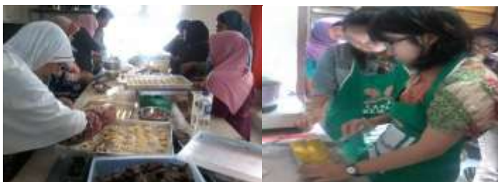
Fig. 2. Cake making training for SME.

In this training there were training in making cakes and simple bookkeeping training. For training in baking, for example, how to make cakes with various variants ranging from pastries to wet cakes, while simple bookkeeping training is to make financial statements of Small and Medium Enterprises so that the emergence of accountability and transparency in SME development management. More training as a means aimed at efforts to further activate the work of previously less active members of the organization, reduce negative impacts due to lack of education, limited experience, or lack of confidence from certain members or groups of members. One manifestation of the development of the first productive business is to collaborate with PT. Indofood Sukses Makmur Tbk, both from giving training in making cakes and providing public facilities such as street headbands, aprons, Bogasari tables to trade cakes. The provision of these facilities is expected to support SME members in trading. In addition to collaborating with Bogasari, there is also support from the cooperative and industrial and trade services. Assistance provided by cooperatives in the form of simple bookkeeping training and the provision of Home Industry Licensing by the cooperative service and industry and trade services.