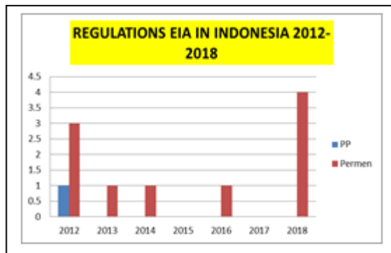
Fig. 2. Regulations EIA.

When determining the limits and scope of the LCA, it cannot be separated from the Environmental Impact Assessment (EIA) or AMDAL activities that are limited. In Indonesia, there are many regulations about Environmental Impact Assessment (EIA). In this figure, there are some regulations on EIA in year 2012-2018.