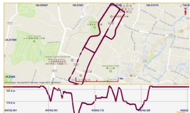
Fig. 3. GPS measurements trajectory

signal outage in this area is multipath error, because of many high-rise buildings, it could be also seen from the DOP and VDOP value is 6.7. This phenomenon can be seen from the error of the GNSS solution only increased before satellite outage occurred. The value of rms error during satellite signal outage is getting worse. This condition shows that GNSS-IMU is 25 up to 45 times better compare to GNSS solution only. GNSS solution only has a problem when there is a loss of GPS signal or phase ambiguity from cycle slip. It could be seen from the figure after satellite signal outage during 45 seconds. The value of rms error requires more or less 4 seconds to become stable. It could be understood, because in the GNSS solution only, INS data cannot be used for ambiguity estimation. On the other hand, GNSS-IMU integration has a character of faster ambiguity estimation.