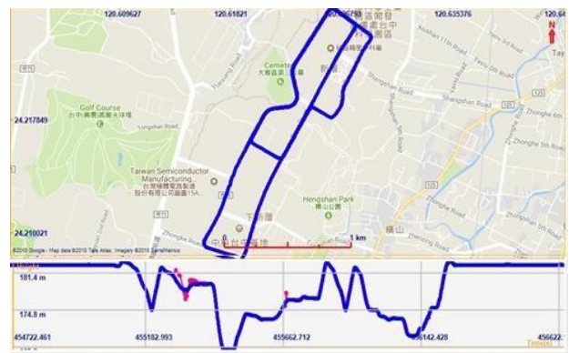
Fig. 4. GPS-IMU trajectory

The figure above represents GPS measurements before being integrated with IMU, the trajectory is not continuous because the satellite outages occur several times. GPS recorded the data every single second. We computed the average time of the satellite outage and we found out that in 56 seconds GPS receiver was not recorded the data due to obstacles that surround the area.