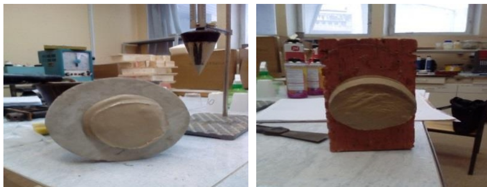
Fig. 2. Evaluation of the runoff of the plaster mix from the base.

At the same time, the ultimate shear stress at the reference cone is estimated. Before measurement in both cases, the thixotropic structure of the mortar mixture is extremely destroyed.