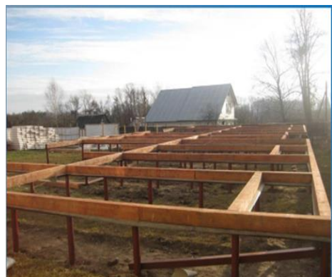
Fig. 8. Screw pile foundation