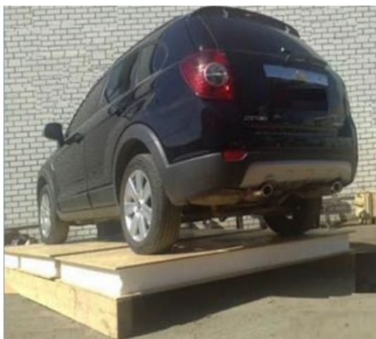
Fig. 4. SIP-panel under load