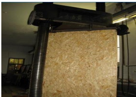
Fig. 6. Horizontal load

The strength of the panel depends on the oriented strand board's strength: