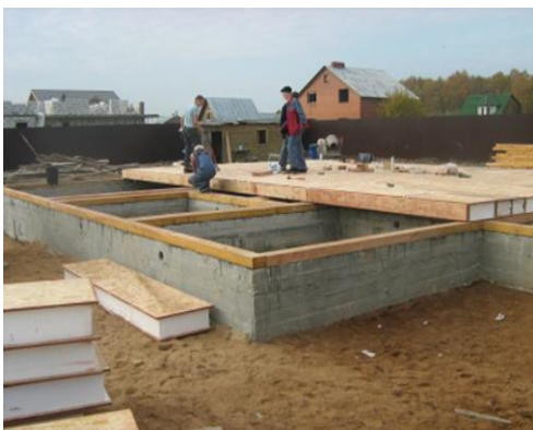
Fig. 7. Shallow foundation

In contrast to the traditional reinforced concrete foundation, foundations on screw piles [fig. 8] can reduce costs by 30-40% and allow installation on complex soils in 3-4 days.