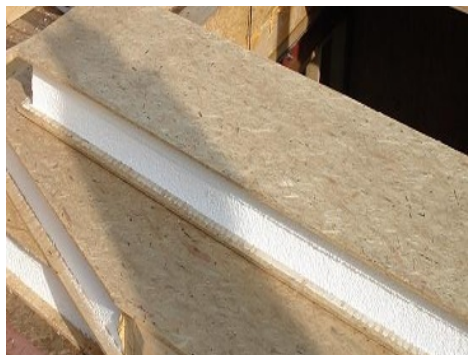
Fig. 1. General view of the SIP-panel