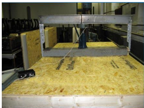
Fig. 5. Horizontal load