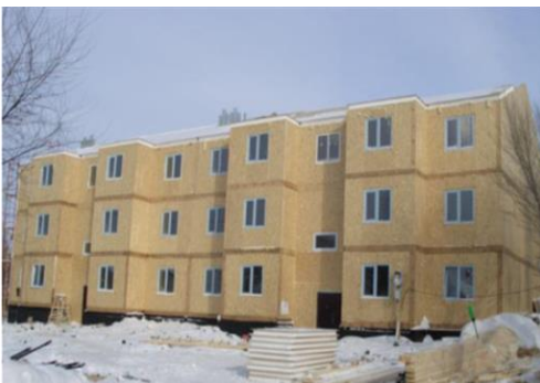
Fig. 2. Multi-familial residential house made of SIP-panels