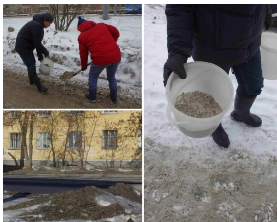
Fig. 1. Snow-dirt sludge at the road, intra-yard passage and sidewalk, dirty snow pile stored along the roadside.

where Pr is average monthly atmospheric precipitation value for the meteorological station Ekaterinburg WMO_ID = 28440 from website rp5.ru ( http://rp5.ru/archive.php?wmo_id=28440 ), E – evaporation value. The evaporation value was calculated as E = 0.37 \cdot n \cdot d , where n is the number of days for the period, D (mm Hg) – average air humidity deficit at the height of 2 m for the period [14]. The air humidity deficit for the studied period was calculated as a difference of pressure of saturated and partial pressure of water vapor. The partial pressure of the water vapor was calculated for the pressure of saturated water vapor and relative air humidity. The equilibrium pressure of saturated water vapor was determined by psychrometric tables at a positive air temperature above water at a negative air temperature.