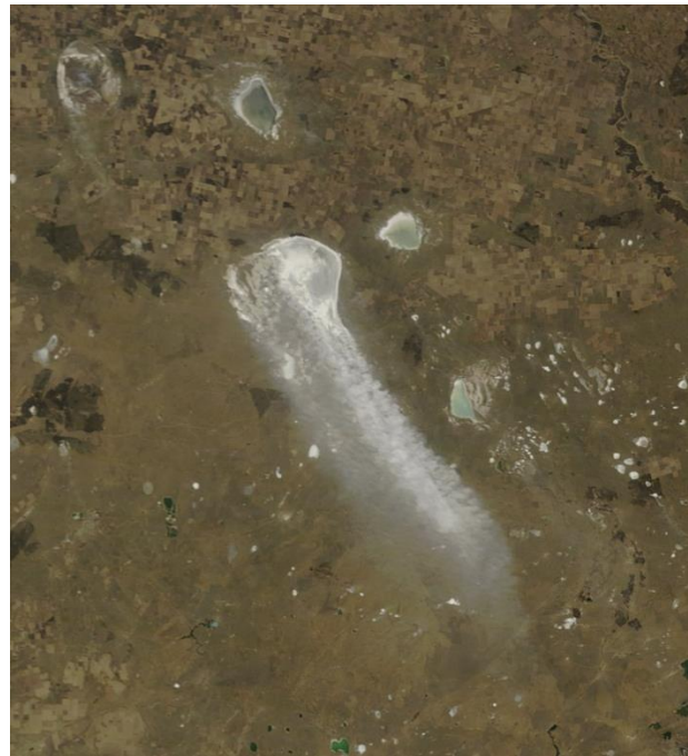
Fig. 2. A plume of saline dust blown from Lake Siletiteniz in northern Kazakhstan.

The deposition of dust in mountainous regions also has important implications for water supplies used for agricultural and urban purposes in surrounding lowlands. Dust deposition on snow and ice reduces the surface albedo and accelerates melting, hence affecting the magnitude and timing of meltwater and runoff availability [28]. Climate modelling simulations also indicate that aerosols such as desert dust, frequently mixed with anthropogenic pollution, can enhance climate warming when deposited on snow and ice. In the Himalaya-Tibetan Plateau region, sometimes referred to as the Water Tower of Asia, climate models have also indicated that the summer monsoon circulation may be perturbed by the effects of mineral dust deposition.