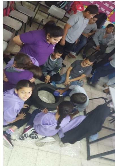
Fig. 2. During meetings held within the school, the HIT students taught the pupils via games and activities what renewable energy means, how to turn waste into a resource, what energy conversion mean etc.