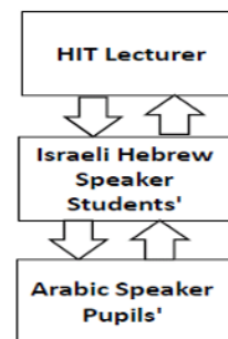
Fig. 3. The course "Green Ambassadors" approach that included mutual fertilization between the students and the pupils, in which the students got familiar with the Arabic society and passed their environmental knowledge to the pupils.