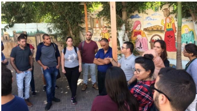
Fig. 1. HIT students visited "Alomariya" school in Ramla and learned from the school's staff about the Arabic society.

The three part of the course shows how the theory becomes practical and concrete. At this stage, students are asked to introduce to the pupils, lesson with language barrier focused on presenting the environmental issues: Energy efficiency (saving), solar energy, energy conversion, air pollution, water pollution, waste, recycling (Fig 2).