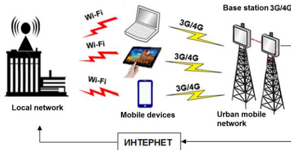
Fig. 1. A diagram of wireless access of mobile devices to local network of the company.

2) a complete scenario – it implies synchronization of data on PS between mobile devices and DB of a company via mobile and local networks (including with territorial constraints) when codifying the data transmitted.