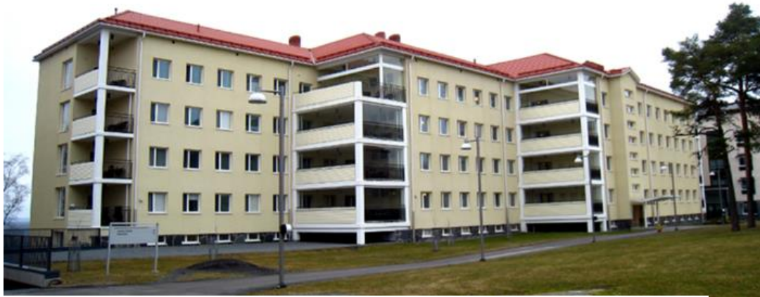
Figure 1. Jukola building in Koukkuniemi old people's home.

Finnish climatic zones (I-II) describing the current climatic conditions of Southern Finland was used in the study [7].