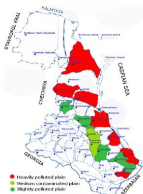
Fig. 3. Ranking of the territory by toxicological load on the example of the Republic of Dagestan.

We have found that a large degree of environmental pollution has been established on the territory of the plain zone of Dagestan and is associated with a high intensity of chemical treatments on agricultural crops that produce food; the treatments can be as frequent as 20 times per season. Next, the territory is ranked and divided into foothill and mountain land. On the basis of the conducted research, an ecotoxicological map of Dagestan was compiled with the release of contaminated zones (Fig. 3). The comparison of incidence rates of dental anomalies (Table 2) with the pesticidal load showed that it is higher in the lowland zone, which correlates with our data on pesticidal load.