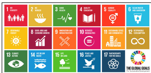
Fig. 1. Sustainable Development Goals[1]