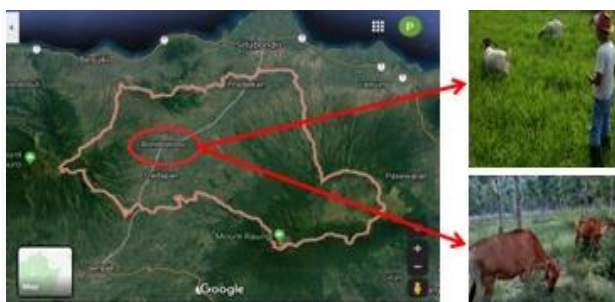
Figure 1. The study area in Bondowoso East Java Province, Indonesia

The study was conducted at field farming with large area ± 1.2 ha, consists of 6 cows, and 10 goats in Bondowoso East Java Province, Indonesia. The topography of the Bondowoso from an altitude 113°48'10" - 113°48'26" BT dan 7°50'10" - 7°56'41" LS.