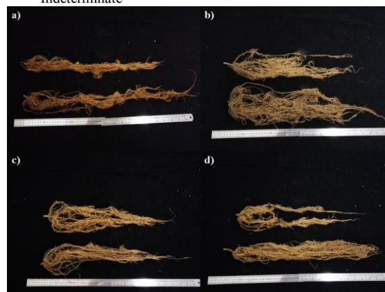
Note : a) Non-saline stress ( 0.42 \text{ dS}\cdot\text{m}^{-1} ); b) Low saline stress ( 2.93 \text{ dS}\cdot\text{m}^{-1} ); c) Low saline stress ( 4.74 \text{ dS}\cdot\text{m}^{-1} ); d) Moderate saline stress ( 6.03 \text{ dS}\cdot\text{m}^{-1} ), Left = Determinate; Right = Indeterminate.

sign of standard error. DET = Determinate ; IND = Indeterminate