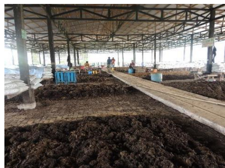
Fig. 2. Large scale biopeat production in Pulau Burung District.

While the Water Management Trinity ensures that the land is not exposed to fire risk, the effort to reduce the use of fire in clearing land is by the application of biopeat. Previously, farmers used grilled ash from land burning to reduce the land’s acidity level. Essentially, biopeat is used to increase the soil’s pH level. Pulau