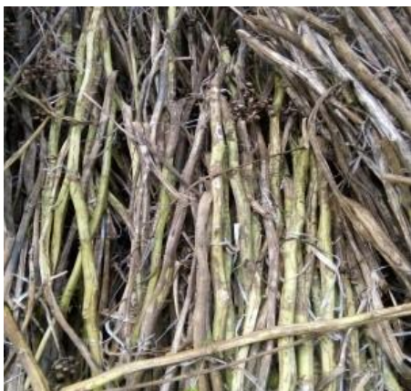
Fig. 1. Tobacco Stems

the fixed carbon, [12] for the total sulphur. The ultimate analysis of bio briquettes is accorded to [13] for the calorific value. The proximate analysis of bio pellets regarding [14] for the ash content, [15] for the fixed carbon, [16] for the moisture content, and [17] for the volatile matter. The ultimate analysis for bio pellets are [18] for the calorific value and [19] for the bulk density. Both describe and analyze the application of tobacco waste products to raise agriculture productivity and a positive impact on the environment.