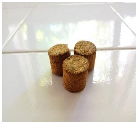
Fig. 4. Biopellets with diameter 4 cm and 6 cm height

The pellets samples tested on five times repetition and calculate the average value (mean). The mean of proximate analysis of bio pellets consist of water content was 3.9%, the volatile matter was 87.75%, ash content was 5.75%, fixed carbon was 2.77%. The mean of ultimate analysis was bulk density was 0.50 gr/cc, the calorific value was 4,793.78 cal/gr, bio pellet consumption speed was 0.24 kg/hour, and weight of ash was 0.232 kg.