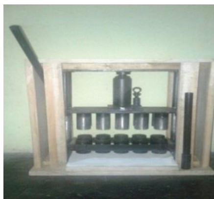
Fig. 2. Semi Manual Press with 10 cylinders form holes