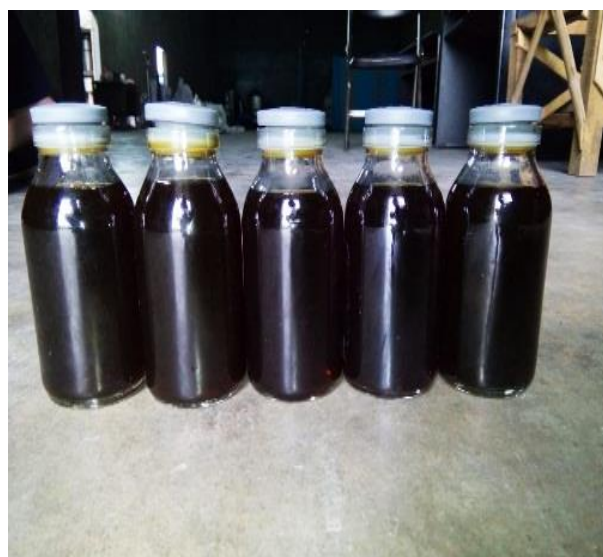
Fig. 5. Liquid Smoke

When stems char made, the smoke was burnt to the pipes and condensed. Therefore, the gas phase from smoke changed into a liquid phase and became liquid smoke. So, from one reactor, the author got two products at once, there was biochar as raw material for bio briquettes and tobacco liquid smoke. The process of making a new product is channeled and made into a unique advantage product. In other words, the making of briquettes and liquid smoke is not only reduced by the solid waste in tobacco plantations but also minimizing water pollution in the environment. The Visualization of tobacco liquid smoke is presented in Figure 5.