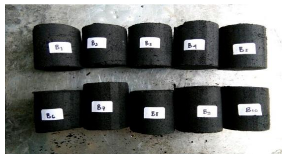
Fig. 3. Bio-briquettes

The effort to minimize the impact caused by the use of coal briquettes is the use of biomass briquettes from tobacco stems. The bio-briquettes are described in Figure 3 below.