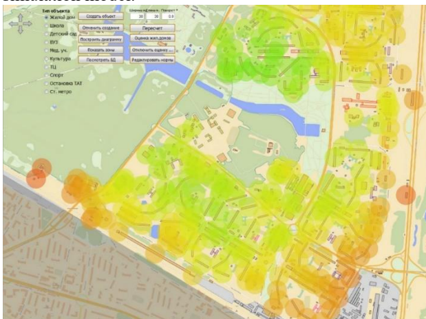
Fig. 2 Energy consumption of the studied part of the urban area.

Figure 2 shows a screenshot of the results of the simulation model.