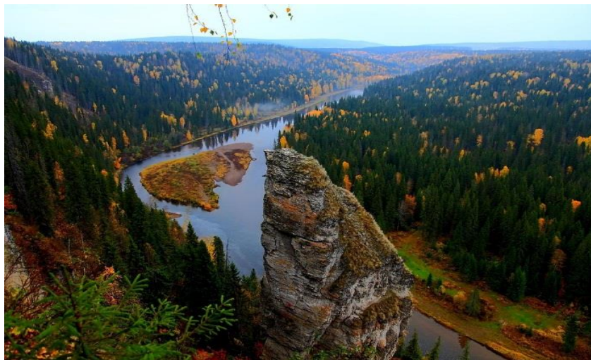
Fig. 1. Natural landscapes of the Sverdlovsk region.

For the Sverdlovsk oblast forests work on the determination of allowable recreational loads was conducted at the Institute of forest, Ural branch, Russian Academy of Sciences, which found that among the main tree species are most sensitive to recreational loads spruce, followed by pine and hardwoods. Thus, natural zones, subzones, terrain, forest types, and the main forest-forming breed were factors that caused the differentiation of permissible recreational loads for forest areas depending on their degree of fitness for recreation.