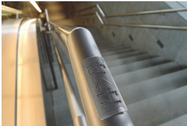
Fig. 5. Brail to indicate the way in the subway

In Chester, Melbourne and other cities more accessible projects are emerging as a result