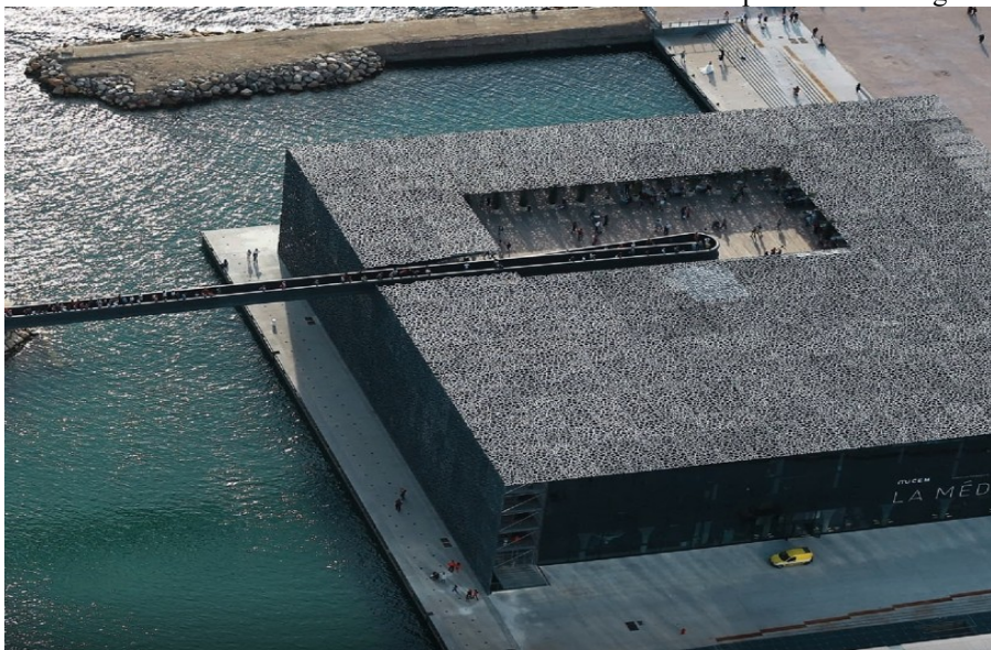
Fig. 1. Ramps and bridges connecting two sites of the MUCEUM

Fortunately, the idea that the question of disability in our infrastructure is a social issue, is beginning to permeate people's minds. Let's see the example of the architect Rudy Riciotti. This architect builds the MUCEUM of Marseille (Museum of European and Mediterranean civilizations in Marseille, France). He also builds the Philharmonic of Potsdam, Germany. For him the social model of disability disrupts the vision of social housing. According to him the accommodation belongs rather to the republic than to the people itself. But Individual requests, for the renovation of historic monuments, for example, must be considered and a solution of understanding can be found to satisfy the users but also his personal vision. In his project of Muceum, areas that previously were not accessible, became accessible thanks to ramps of access. Meeting the needs of people with disabilities should be a moral duty for construction professionals. Like any social movement, it takes a certain amount of time to be integrated by society. A few years ago, who could have considered automatic doors as a normality for shopping centers, hospitals, railway stations ... This measure, which was initially intended to facilitate access to people with disabilities has, over time, become a basic standard for this type of building. Maybe in the future the automatic doors will be the norm also for individual personal buildings.