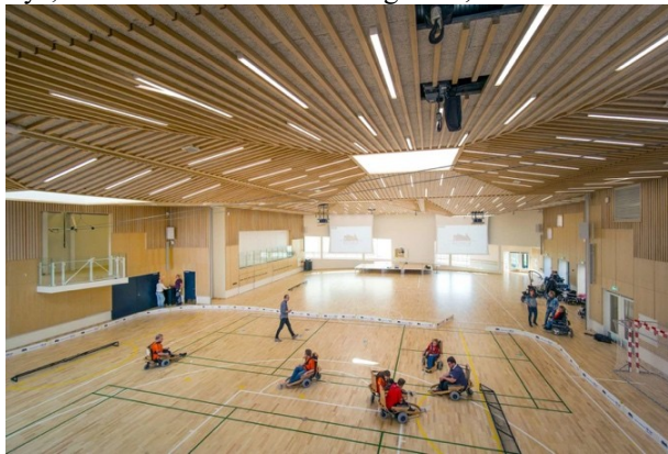
Fig. 4. Accessible sport complex in Korsør