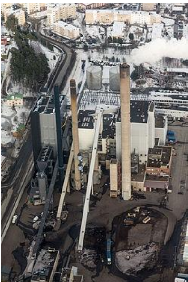
Fig. 1. CHP power plants in urban city area, Haapaniemi.

Kuopio Energy Ltd, owned by the City of Kuopio, produces electricity and district heat using combined heat and power production (CHP) process. Company uses mainly bio-based fuels for its CHP production units and these bio-based fuels are delivered from mainly nearby sources from the North Savo area. Kuopio Energy's subsidiary, Kuopion Sähköverkko Ltd is responsible company for the electricity transmission from the plant to Finnish energy grid. Kuopio Energy Ltd yearly electricity production is around 700 GWh and it also produces around 900 GWh of district heat in a year. Kuopio Energy serves roughly 50 000 electricity and 6 000 district heating customers, and the consortium employs approximately 160 people. CHP power plants are in an urban city area Haapaniemi (Figure 1.). Biogas power plant locates in Pitkälähti close to a sorting and environmental station of norther Savo region.