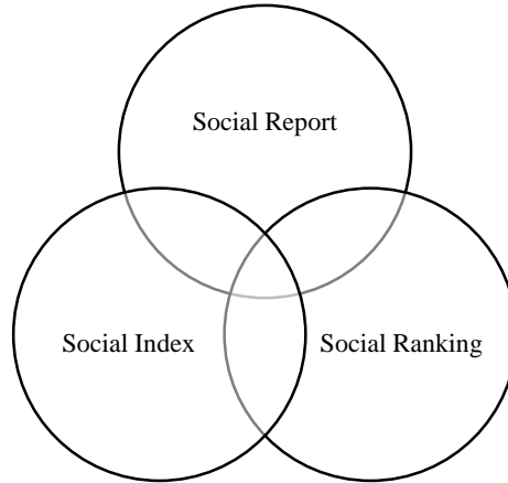
Fig. 3. Tools for assessing the social contribution of companies

Fourth, the authors recommend evaluating particular indicators of the social effect of foreign companies in a given region. These include the following indicators: