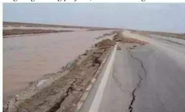
Fig. 2 Highway crack in soft soil foundation

foundation will cause cracks in municipal road and bridge engineering projects, as shown in Fig. 2: