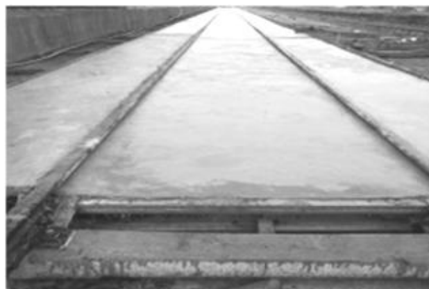
Figure 3. Construction of Track Bed for Subway Ballastless Track Effect Chart

It can extend rail using Life through strengthening the rail management and maintenance. However, there are many factors that affect the rail service life. Thus it is necessary to consider the specific factors and take scientific and reasonable solutions to strengthen the rail protection. For example, it has a strong corrode to load material sulfur sand, which will cause certain corrosion to the rail if there is a long time contacting and affect the quality of the rail. The rail bottom and rail waist should be paid special attention to. It can avoid corrosion to the rail and prolong the equipment service life if reducing the direct contact of the loading material sulfur sand. The application of the subway ballastless track can meet the development needs of modern society and effectively solve the problem of urban traffic congestion, as well as reducing urban vehicles and the pollution to the environment, so as to create the good living environment for people.